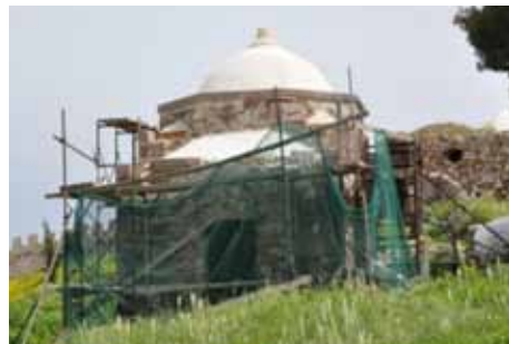
(Tekye at Mytilene)

The dervish lodge (tekke) is a single-unit, domed building with semi-circular openings. The dome is supported on four arches by the means of spherical triangles, and it has been exteriorly defined by a prismatic moulding.