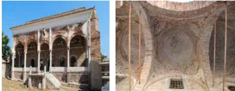
( Yeni Camii at Mytilene )

The mosque along with the Carşı Hammam constituted parts of the kulliye , that is, of the architectural complex. The monumental character of Carşı Hammam is instantly appraised due to its conceptualized and highly linear lay-out.