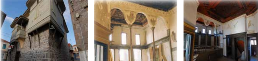
(The Varelzidenas mansion house at Petra, Lesbos)

The dervish lodge (tekke) is a single-unit, domed building with semi-circular openings. The dome is supported on four arches by the means of spherical triangles, and it has been exteriorly defined by a prismatic moulding.