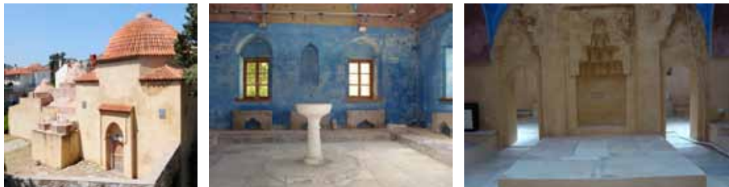
( Carşı Hammam at Mytilene )

The mosque along with the Carşı Hammam constituted parts of the kulliye , that is, of the architectural complex. The monumental character of Carşı Hammam is instantly appraised due to its conceptualized and highly linear lay-out.