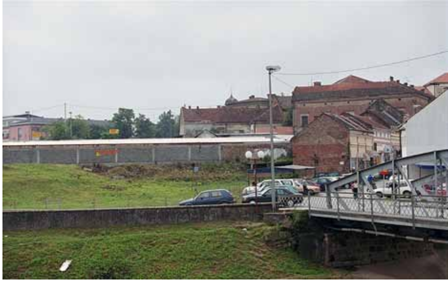
RESİM 17. Bosnia-Herzegovina. Brčko – Site of the destroyed Atik Mosque (2002). Bosna-Hersek. Brčko – Yerde bir edilen Atik Cami'nin yeri (2002).