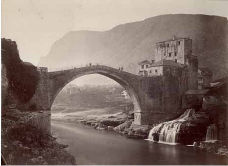
RESİM 18. Bosnia-Herzegovina. Mostar – Old Ottoman Bridge (1557). Historical photograph, ca. 1900. Bosna-Hersek. Mostar – Eski Osmanlı Köprüsü (1557). Tarihî fotoğraf, 1900.