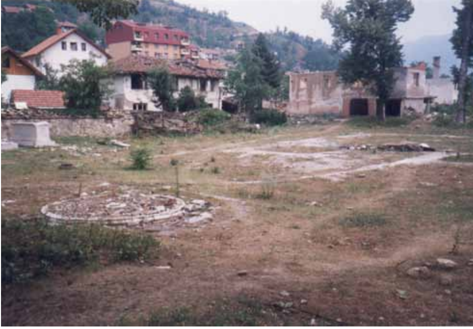
RESİM 11. Bosnia-Herzegovina. Foča – Site of the destroyed Aladža Mosque (1996). Bosna-Hersek. Foča – Yerle bir edilen Alaca Cami'nin yeri (1996).