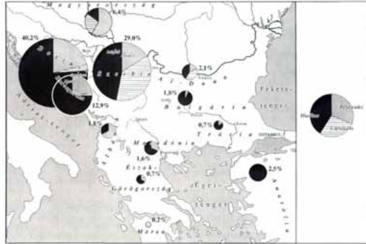
III. 2. The districts of origin of the new recruits in the forts of the vilâyet of Buda, 1558. In the circles, the black segments indicate Muslims, the grey ones converts to Islam, and the lined ones Christian