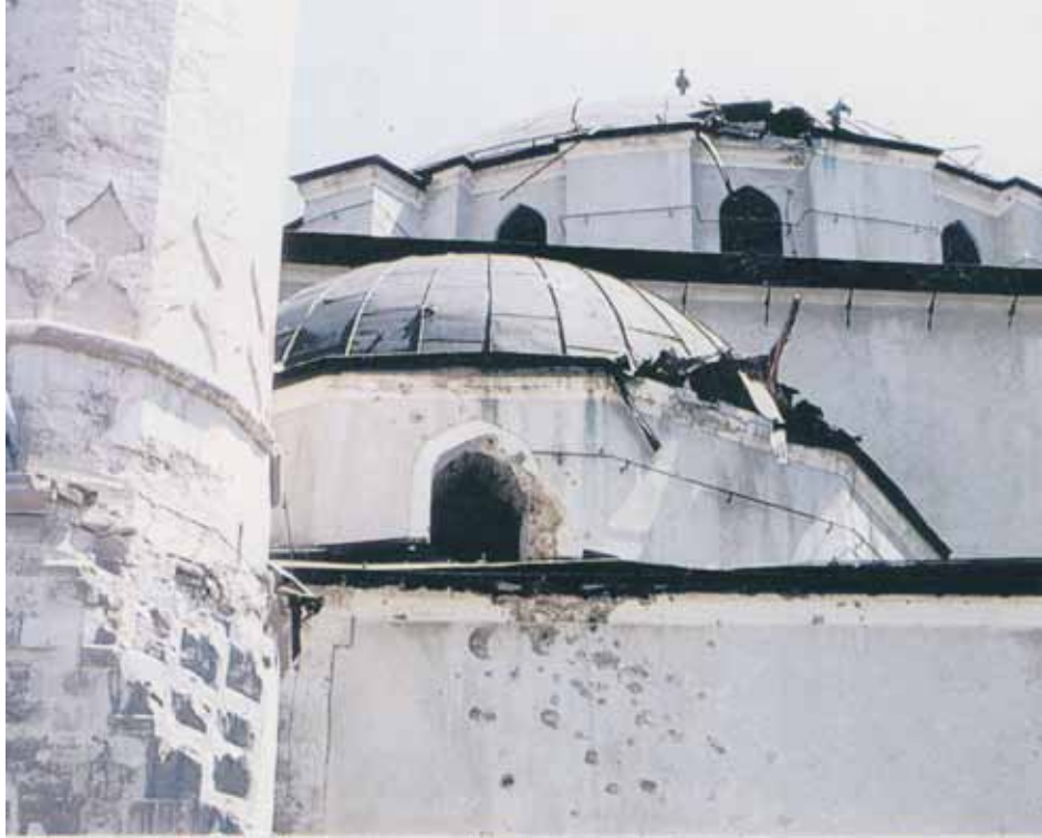
RESİM 12. Bosnia-Herzegovina. Sarajevo – Projectile impacts on the Gazi Husrev Beg Mosque. Bosna-Hersek. Saraybosna – Gazi Hüsrev Bey Camii'ne isabet eden top mermilerinin izleri ve yıkıntıları.