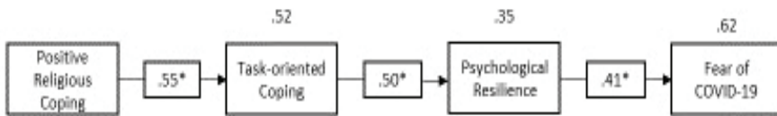
Figure 2. Path analysis and standardized regression coefficient for the final model (* p < .001 )

Figure 1 shows the values of the regression coefficients and the significance of the hypotheses test results. The path between positive religious coping and resilience, and the path between task-oriented coping and COVID-19 fear, did not seem meaningful. For this reason, these pathways were excluded one by one and not added to the analysis model. 76 Figure 2 shows the analysis of the path and the standardized regression coefficients for the final model.