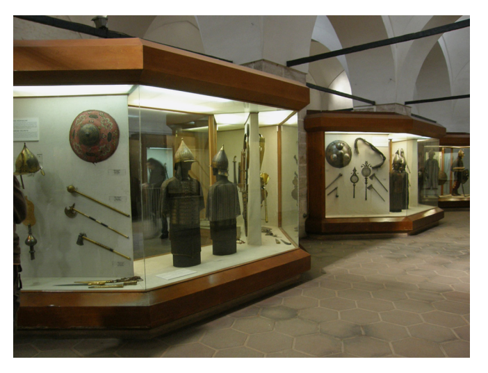
Fig. 6 View from the previous design of the exhibition.

One of the innovations applied in this section was the creation of a music album in the manner of soundtracks for this new exhibition design. The selected important musicians of Turkiye (Cahit Berkay, Demir Demirkan, Erkan