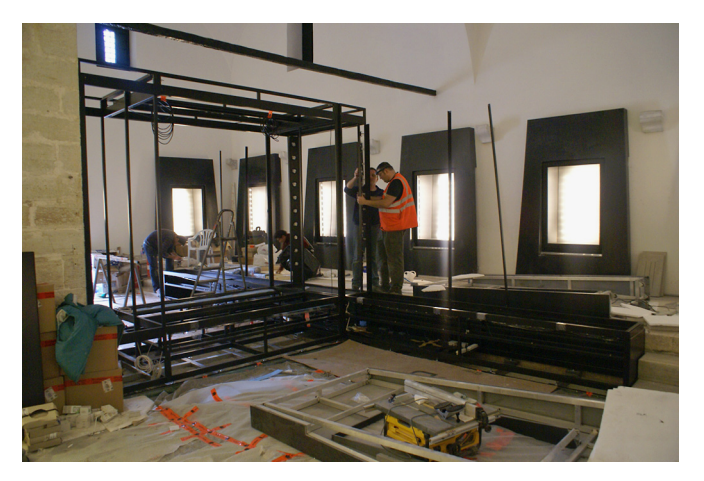
Fig. 7 View of the construction process of display cases.