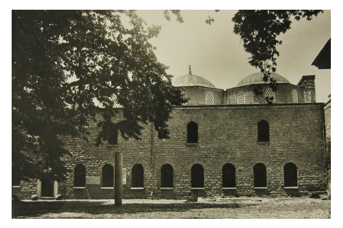
Fig. 1 The front façade of the Outer Treasury after the restoration in 1933 (Altındağ and Bayraktar, 1988). The opened understratum windows had been refilled in an unknown date.

The restoration process continued for two years (2008-2010) under the control of Istanbul Directorate of Surveying and