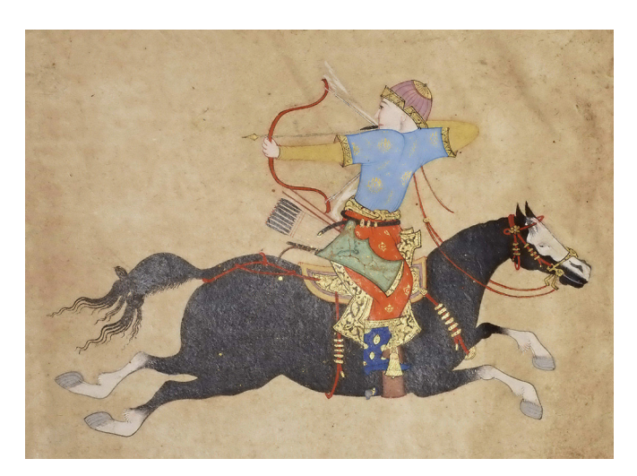
Fig. 10 The archer figure from the Ottoman manuscript (Anon, 16. cen.).