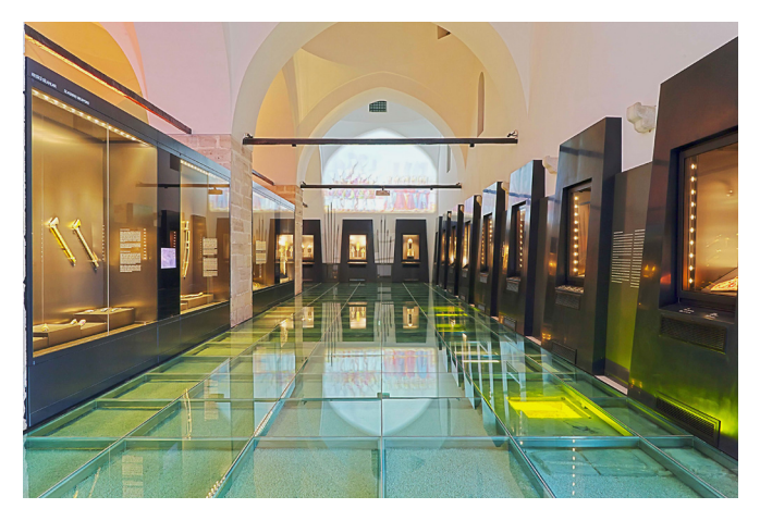
Fig. 12 View from the interior of the Section of Arms and Armours.

selected Ottoman miniatures involving war scenes. As they were played in sequence, they filled the parts of the regions on the map when their turns were finished. These limited narrations of Ottoman deployment were presented on a rectangular board with red LED behind the printed historical Mediterranean map. The clips regarding the deployment played on LCD screens had total duration of 7 min Figure 11.