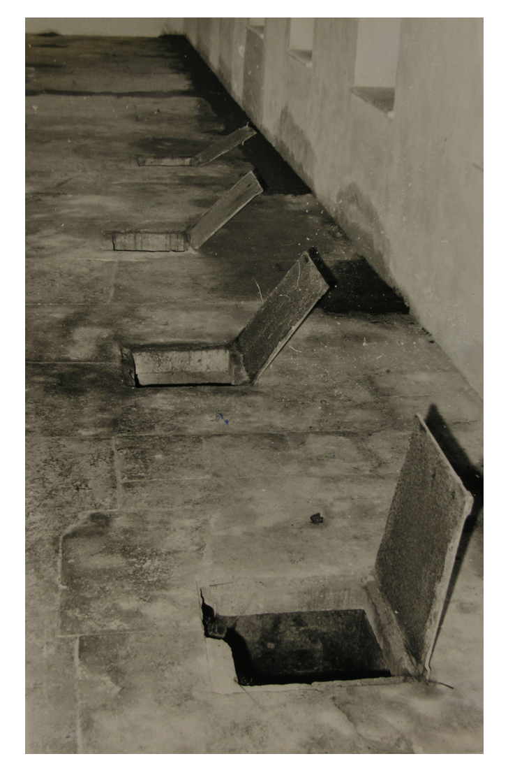
Fig. 2 View from the caps covering the sarcophaguses and the baptismal pool. The floor had been covered with terazzo floor in a later restoration.

Monuments (Ministry of Culture and Tourism) and Istanbul Special Provincial Administration. In addition to traditional restoration interventions, the structure was also consolidated by means of carbon fiber applications. The first archeological excavation in a closed space of Topkapı Palace was realized.