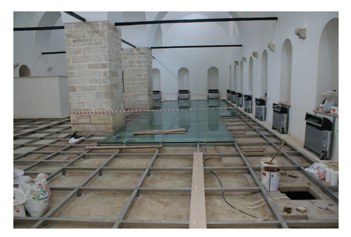
Fig. 5 Covering the original floor with glass panels.

The aim was to exhibit the original structure as an item inside the display case as well as to ensure the disabled visitors to see these items despite of the inconvenience