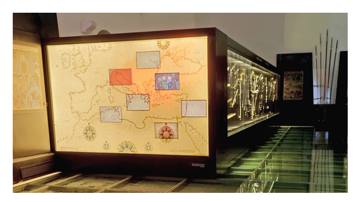
Fig. 11 Presentation of seven great Ottoman wars by clips on the Ottoman map.

to create a perception of the Ottoman army of the same period against the European point of view (Arifi, 1558; Emir Hüsrev Dehlevi, 1496; Seyyid Lokman, 1584, 1589) Figure 9. Within the display cases, animation films on archers (Anon, 16. cen; Arifi, 1558; İntizami, 1587; Seyyid Lokman, 1584), swordsmen and riflers (Arifi, 1558; Seyyid Lokman, 1581, 1584,1589) were screened according to the chronological order of the items derived from the Ottoman visual images. They were desired to present the production and use of these weapons by means of Ottoman miniatures in a cartoon style as well as ostracizing the thought of antagonism by neglecting enemy figures Figure 10.