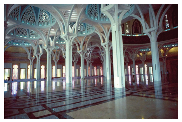
Fig. 12. Sarawak State Mosque, Sami Mousawi. Sarawak, Malaysia,1990. View from the interior. https://archnet.org/media_contents/13469

with the firm of Paolo Portoghesi in Rome, the Centro Islamico Culturale d'Italia, completed in 1995 (Figure 13). Here, references to the earlier hypostyle mosques and the later central-spaced mosques expand the conception of "Islamic architecture", which never had a single line of stylistic development. Most importantly, ornamentation, an essential element for cultural signification, was not superposed on the structure but made an integral part of it, adding to the effect of lightness and dematerialisation created by the white-washed embroidery-like elements.<sup>38</sup>