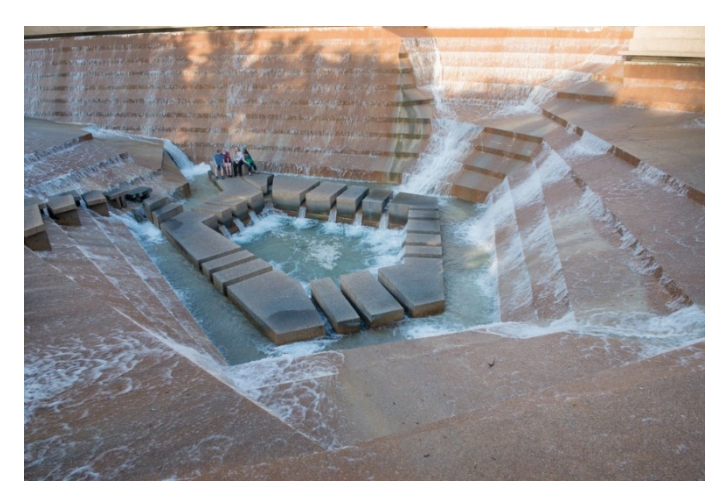
Figure 1. Fort Worth Water Gardens

When water features mentioned properties are evaluated together, the presence of sound, image, and tactile texture features can be observed on YouTube videos. YouTube videos found no statement regarding the senses of smell and taste (Table 3). Considering the mentioned properties of water according to its physical structure, it is possible to exist in liquid form and vapor forms. Considering the climatic conditions of the place where the design is made, water has no chance of appearing in a solid form. Considering the aforementioned properties according to the flow direction of the water, vertical, horizontal, and multi-directional movements are available.