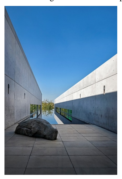
Figure 6. Pulitzer Arts Foundation at St. Louis, Photography: William Zbaren

This design is located in a built environment with a linear and rectangular water court. On videos of this design, the water feature appeals to the one sense. The water feature is located between the masses. On one side, it opens to the void that reflects nature (Figure 6). Water is both an element that reflects nature, and that also reflects the architecture vertically with its closed edges. Humans can experience water by seeing in space.