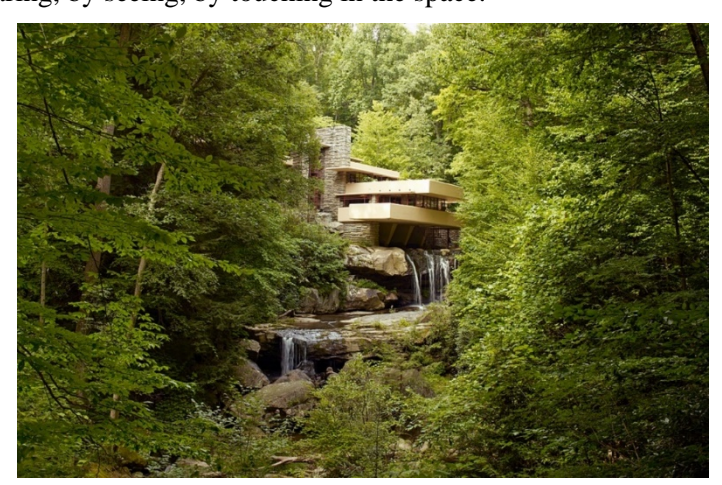
Figure 5. Fallingwater

This design is located in natural environment, and it is associated with a waterfall on Bear Run. On YouTube videos of this design, the water feature appeals to the three senses, and three physical states of water can be seen. It is one of the rare examples where the design is intertwined with water (Figure 5). Humans can experience water by hearing, by seeing, by touching in the space.