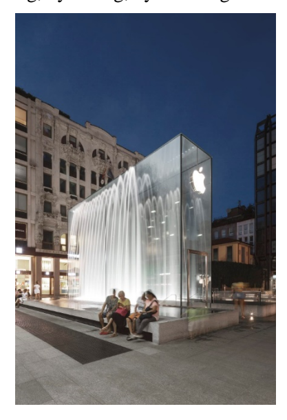
Figure 3. Apple Piazza Liberty

This design is in a built environment with a glass fountain, vertical jets, and two pools. On YouTube videos of this design, the water feature appeals to three senses. The reflective property of glass and the reflective property of water combine. Facade reflections of the historical texture can be seen on glass and water (Figure 3). Humans can experience water by hearing, by seeing, by touching in the space.