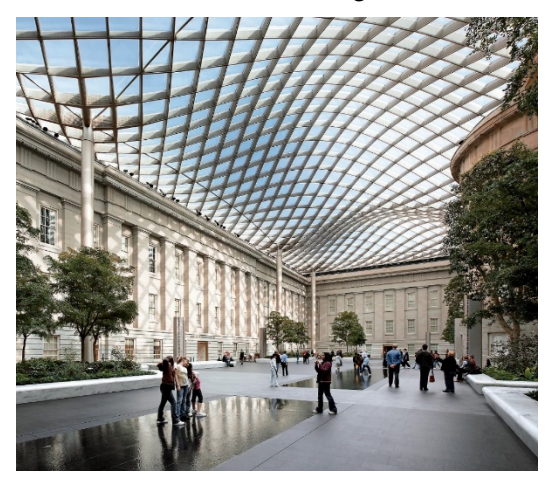
Figure 2. The Robert and Arlene Kogod Courtyard at the Smithsonian Institution

This design is a courtyard in a historical building and is located in a built environment. In YouTube videos of this design, the water feature is directed horizontally and vertically and appeals to the three senses. The water is placed on the ground in bands (water scrims) that do not fill a volume. Humans can experience water by touching this band. The process of removing rainwater from the roof structure, which is the main character of the design, also emphasizes the sound of water. Rainwater on the wave-shaped glass structure passes away through the columns that carry the structure (Figure 2). During this transition, the flow of water is heard through the columns. At the same time, rainwater can be heard in the glass structure on the roof.