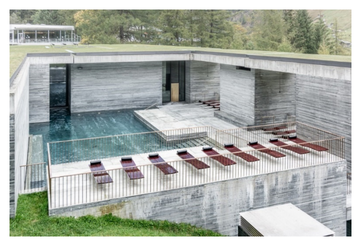
Figure 4. The Therme Vals, Photography: Andrea Ceriani

senses. The water element dominates the spaces between the intersections of the vertical and horizontal surfaces (Figure 4). Humans can experience water by hearing, by seeing, by touching, by, smelling and tasting in the space.